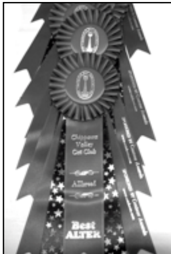
ACFA created a championship class for spays and neuters