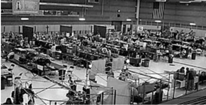
ACFA fosters a fun show hall atmosphere that illustrates its democratic principles at work.

A group of forward-looking cat fanciers formed The American Cat Fanciers Association (ACFA) in 1955 because they were dissatisfied with the existing cat associations and wanted an organization that would give members a greater voice in shaping policies.