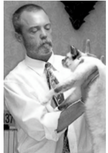
Judges' schools, training programs and exams are all innovations ACFA has made to ensure excellence in judging.

At the end of the show year, each cat's 24 best ring scores determine annual awards at both regional and Inter-American levels. Since ACFA does not use a total-point system, every exhibitor has a chance to win top awards without the expense of showing a cat every weekend, as required by other associations' scoring systems. Furthermore, ACFA awards a specific number of points to each winning cat placement in a show ring, rather than awarding points that vary from show to show as in other associations.