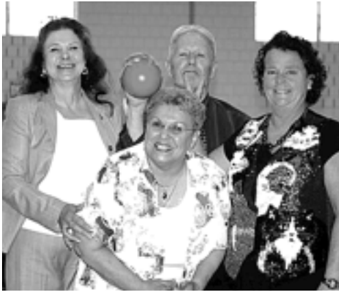
Even judges have fun at ACFA shows. Many are also exhibitors when not judging.

Non-members can register cats with ACFA, but joining brings benefits beyond the registry. ACFA members belong directly to the international organization and have a direct vote in all key matters; other organizations only allow clubs to vote,