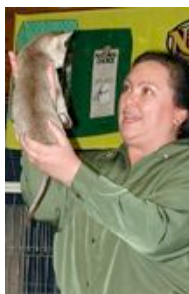
At a typical weekend show, your cat will be judged by six to eight ACFA judges from across the U.S. and Canada.