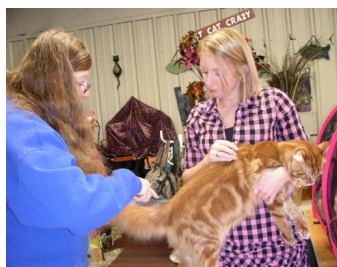
Informal mentors gladly help new exhibitors learn the ropes of showing cats in ACFA.