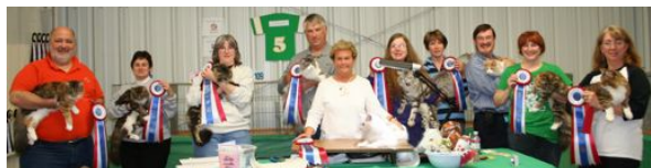
While each cat at a show competes for rosettes at that show, they also compete with other cats in their region and across the U.S. and Canada for year-end Regional and Inter-American awards.