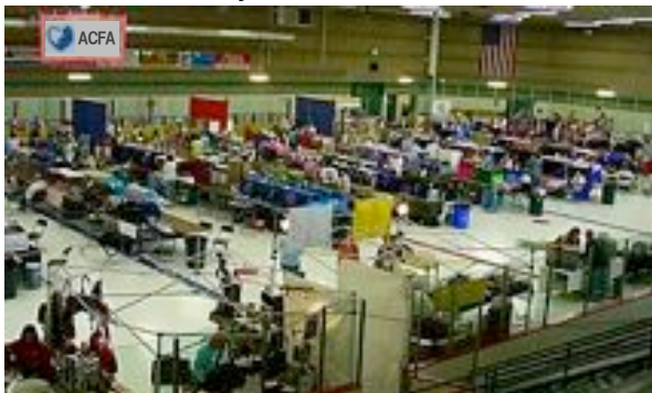
ACFA fosters a fun show hall atmosphere.

Give ACFA a try – You don't even have to have your cat or kitten registered with ACFA to attend your first show.