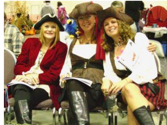
Fun at shows includes costume contests, contests for young people, and dressing to fit the theme of the show.

Finally, there's the camaraderie you find at ACFA shows. Our members welcome new exhibitors and provide informal mentors to coach them on grooming and showing. Themed shows and special events—costume contests, “meet the breed” seminars, and much more—add to the fun and complement the friendly competition in the judging rings.