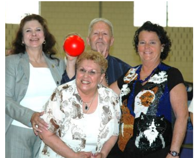
Even judges have fun at ACFA shows. Many also show cats when not judging.

Our Goal is to promote the welfare, education, knowledge and interest in all domesticated, purebred and non-purebred cats, to breeders, owners, exhibitors of cats and the general public.